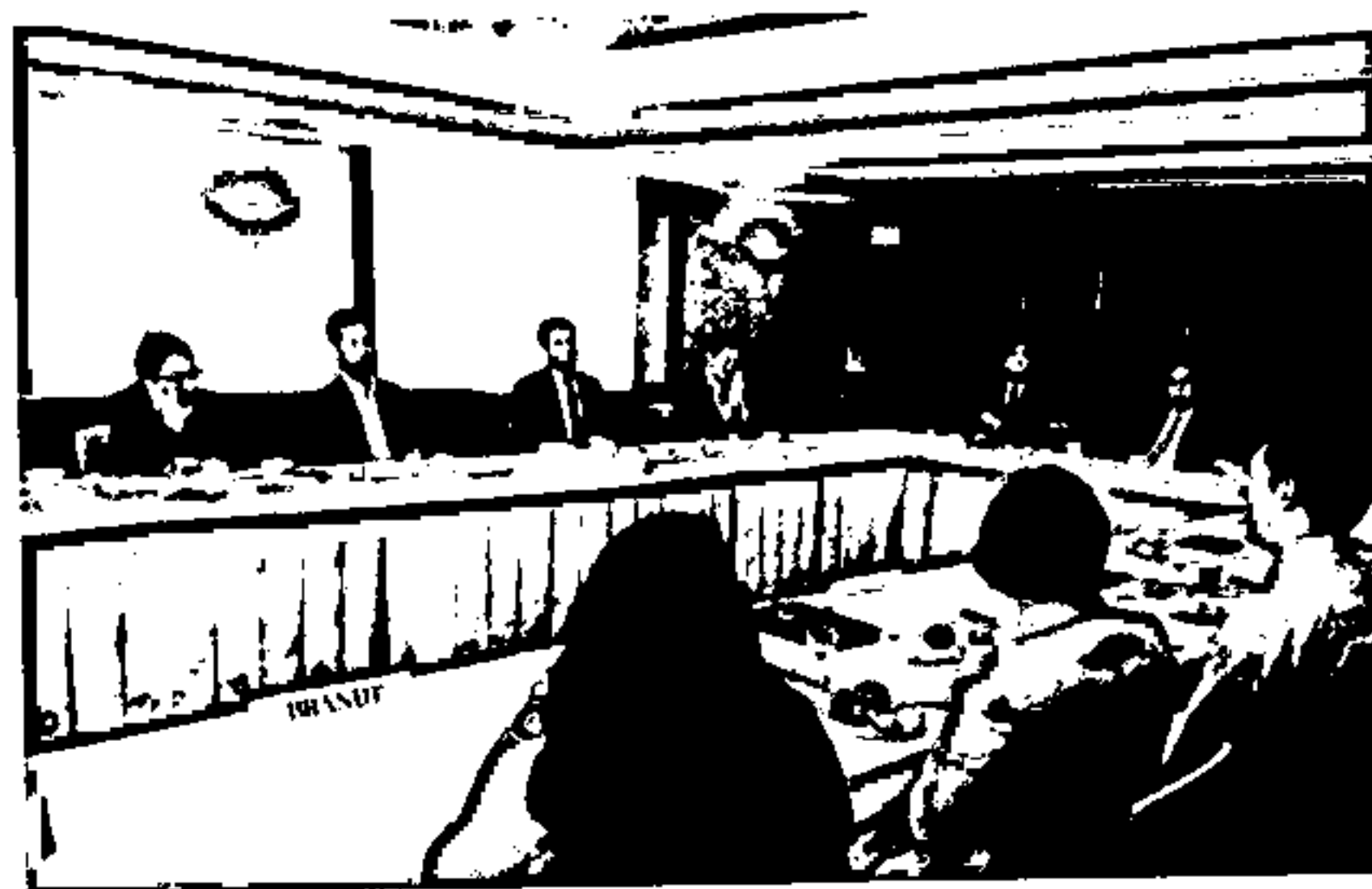
Roundtable with 10 Diet members from all of the major political parties