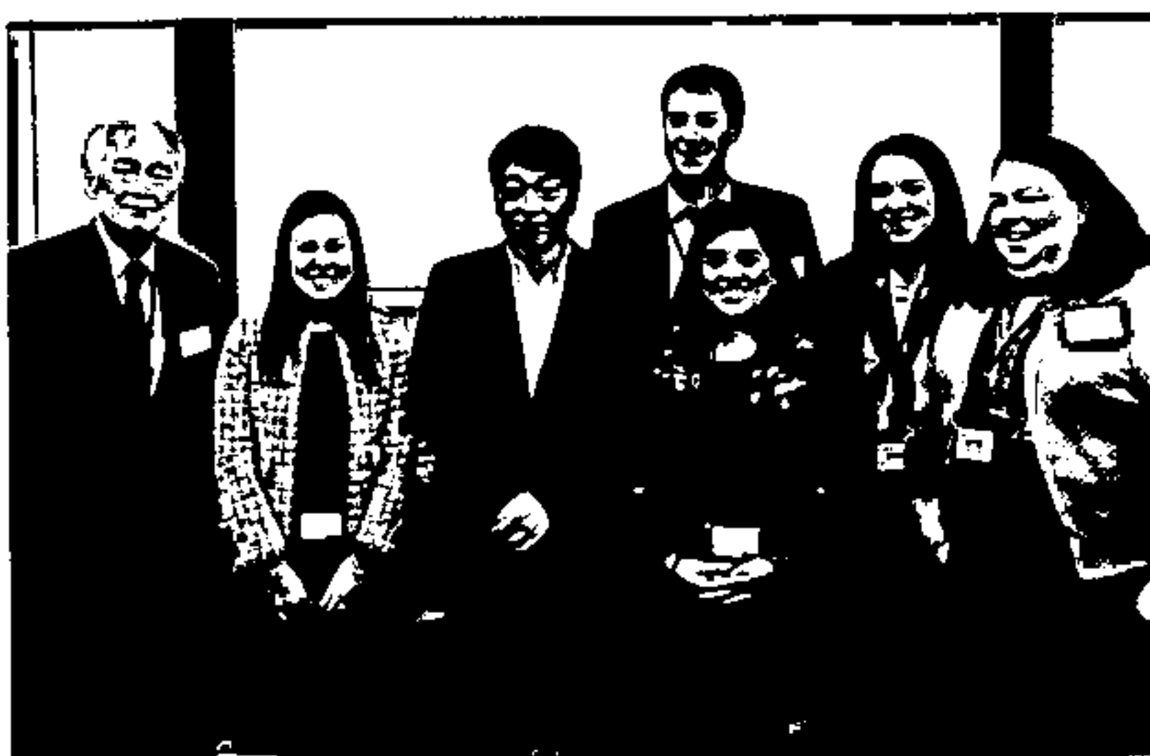
Posing with former Defense Minister Itsunori Onodera