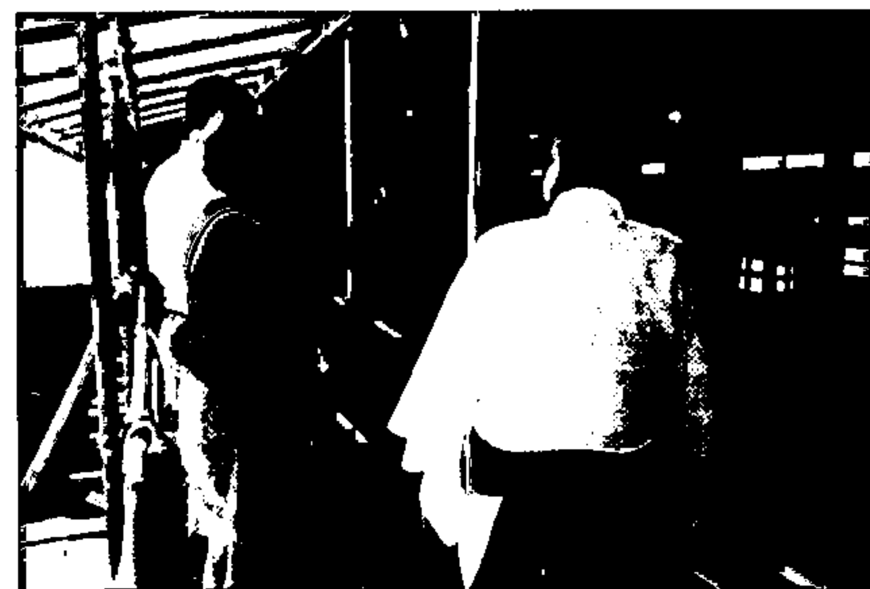
Miyajima priest explains how portions of Itsukushima Shrine, a World Heritage Site, are being rebuilt