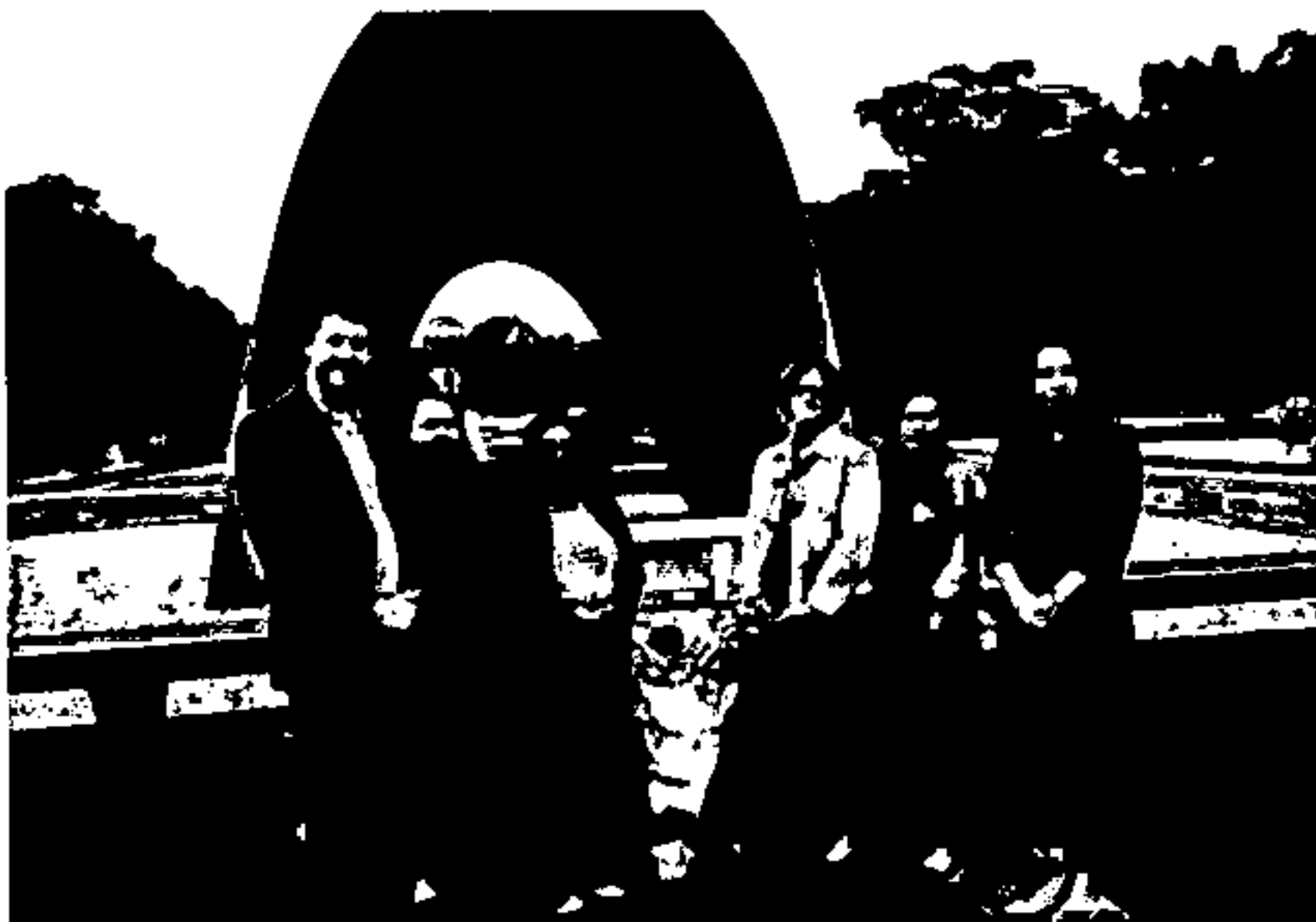
Laying a wreath to honor the Japanese, Koreans, and US POWs who died in Hiroshima